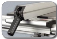
Quick Lock Micro Adjustable Rip Fence