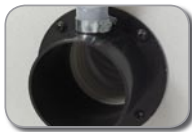
100mm Dust Extraction Outlet

IMAGE SHOWN INCLUDES OPTIONAL EXTRAS REAR TABLE 01448 WHEEL KIT 06920 SLIDING CARRIAGE 01447